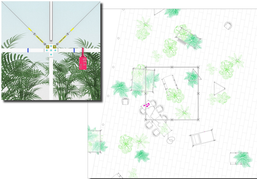
Figure 3. Equipment Details. INSTANT-NATURE by HOME-OFFICE.