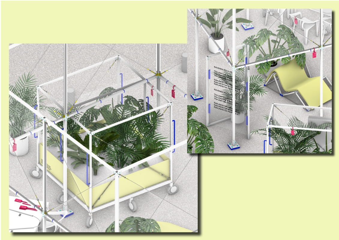
Figure 2. Pavilion Equipment. INSTANT-NATURE by HOME-OFFICE.